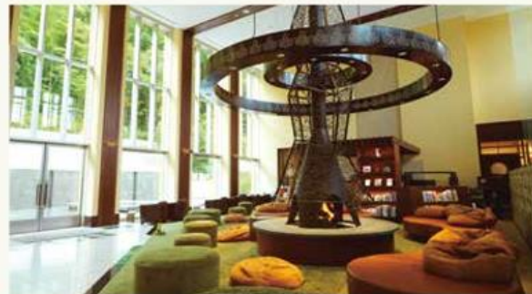
■ Forest Lounge

The towering fireplace in the lobby is the symbol of Mori no Uta. The iron piece covering the fireplace symbolizes a large tree reaching for the sky, while the green carpet symbolizes grass and land. Please take off your shoes and relax.